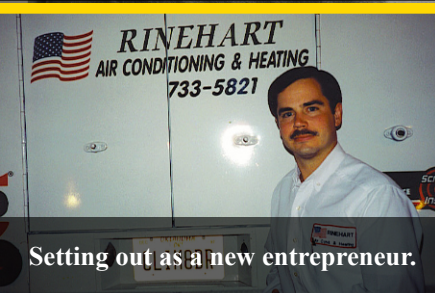
Setting out as a new entrepreneur.